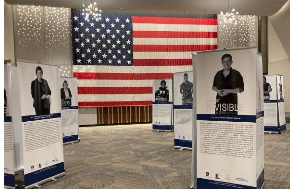
War Memorial Center