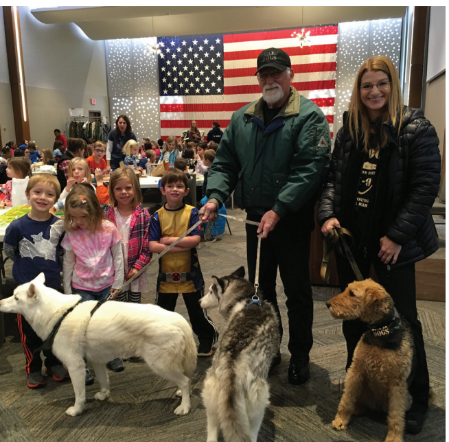
War Dogs is one of our popular education programs drawing in more students than ever before to WMC.