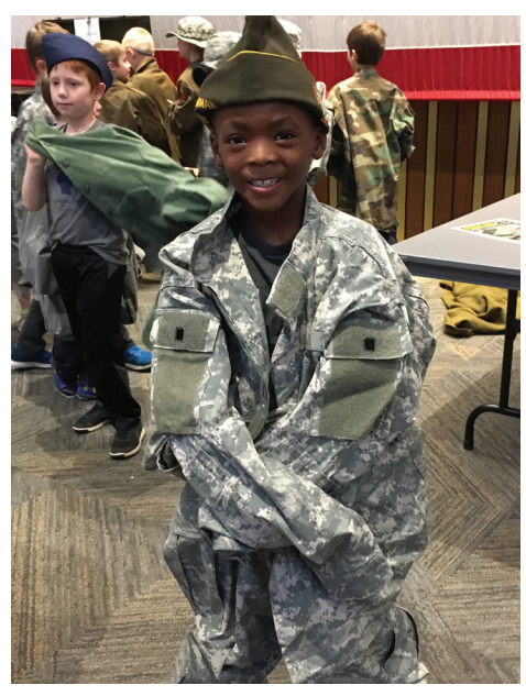
Experience trunks are a huge hit with our youngest visitors. We'll put your donated uniforms to great use!