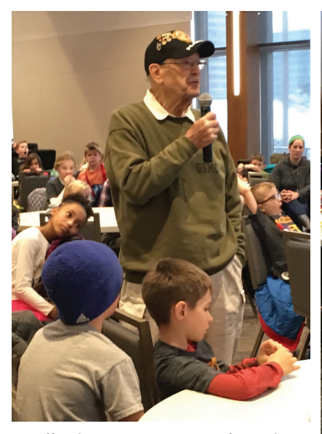
We offer the unique opportunity for students to learn about history directly from those who lived it — our veterans.